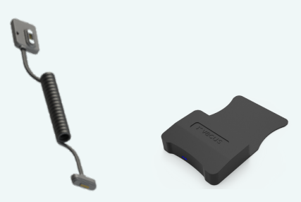
Wired Asset Tag Wireless Asset Tag

Server Location Tag with Temperature-Humidity Sensor